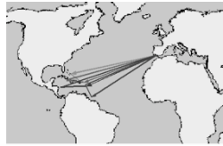
Voyages of Columbus First Voyage (1492) — Third Voyage (1498) — Second Voyage (1493) — Fourth Voyage (1502) —